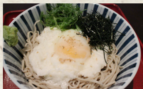
Tsukimi Tororo*...$19.00 月見とろろ

Cold noodles topped with, nori, negi, egg, sesame seeds, grated yam & cold tsuyu dipping sauce