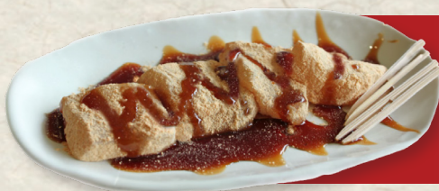
HOUSE-MADE WARABI MOCHI...$8.80 自家製わらび餅

* consuming raw or undercooked meats, poultry, or eggs may increase your risk of foodborne illnessespecially if you have certain medical conditions.