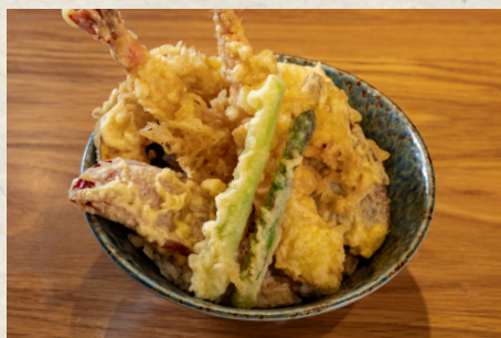
Assorted Tempura on Rice ..... $27.00 天丼