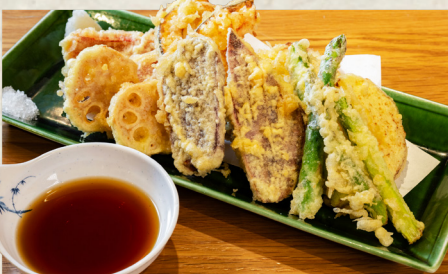
Vegetable Tempura Mix ..... $25.00 野菜天ぷら盛り合わせ