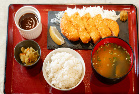
Loin Tonkatsu Teishoku .....$21.00 ロース どんかつ定食

Assorted tempura over rice, miso soup, and Japanese pickles