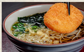
Croquette Kake...$21.00 コロッケかけ

Cold noodles topped with, nori, negi, egg, sesame seeds, grated yam & cold tsuyu dipping sauce