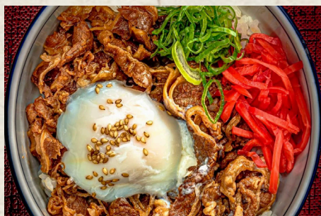
Sweet Stewed Beef on Rice.....$18.00 心玄流牛丼