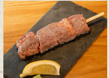
Ribeye Skewer*..... $12.80 リブアイ串