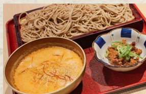
Spicy Miso Tsuke...$22.00 胡麻味噌スパイシー

Hot noodles topped with croquette, fried batter flakes, negi, wakame in hot broth