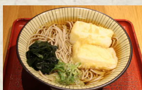
Mochi Tem Kake...$22.00 餅天かけ

Hot noodles topped with deep fried mochi, wakame, & negi in hot broth