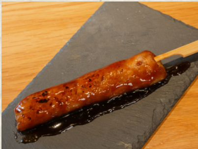
Chicken Tsukune Skewer....$6.00 ツクネ串