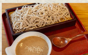
Goma dare .....$19.00 ごまだれ

Cold noodles with, natto, nori, negi, bonito, egg, okra, sesame seeds, grated yam & cold tsuyu dipping sauce