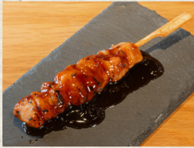
Chicken Thigh Skewer..... $6.00 鳥モモ 串

* consuming raw or undercooked meats, poultry, or eggs may increase your risk of foodborne illness especially if you have certain medical conditions.