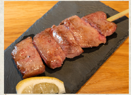
Grilled Beef Tongue*.....$15.80 霜降り牛タン串