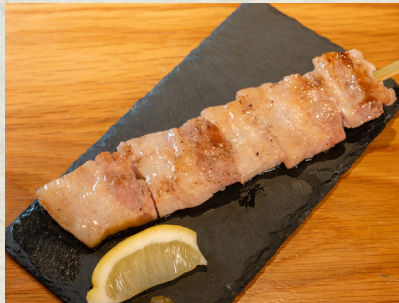
Pork Belly Skewer..... $11.80 豚バラ串