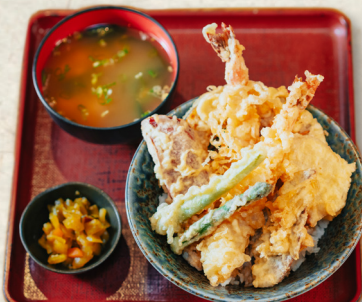
Tendon Teishoku ..... $24.00 天丼定食

Ribeye steak, rice, miso soup, and Japanese pickles