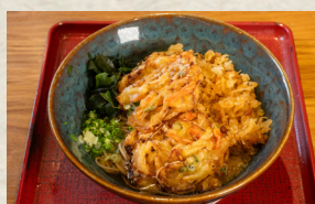
Kakiage Tem Kake $19.00 かき揚げかけ

Hot noodles topped with deep fried mochi, wakame, & negi in hot broth