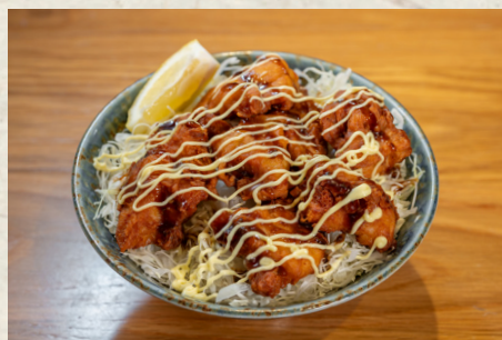
Karaage on Rice.....$18.00 からあげ丼