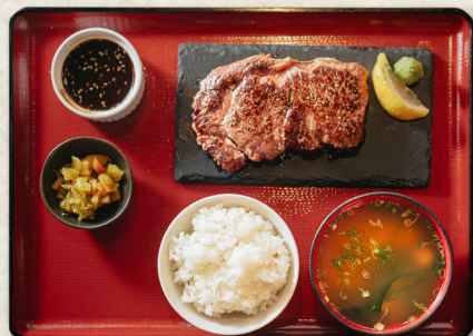
Ribeye steak Teishoku .....$28.00 リブアイステーキ定食

Ribeye steak, rice, miso soup, and Japanese pickles