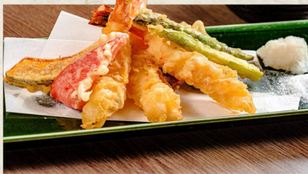
Shrimp Tempura Mix ..... $32.00 大海老天ぷら盛り合わせ