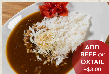
Hiroo Curry and Rice ..... $18.50 広尾のカレー